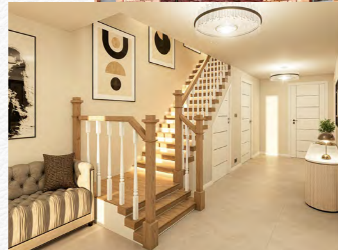
Computer generated images are indicative only and intended for illustrative purposes. Final specification and finishes may vary.

Merrybent is known for its welcoming community and attractive surroundings, yet sits just a ten-minute drive from Darlington town centre.