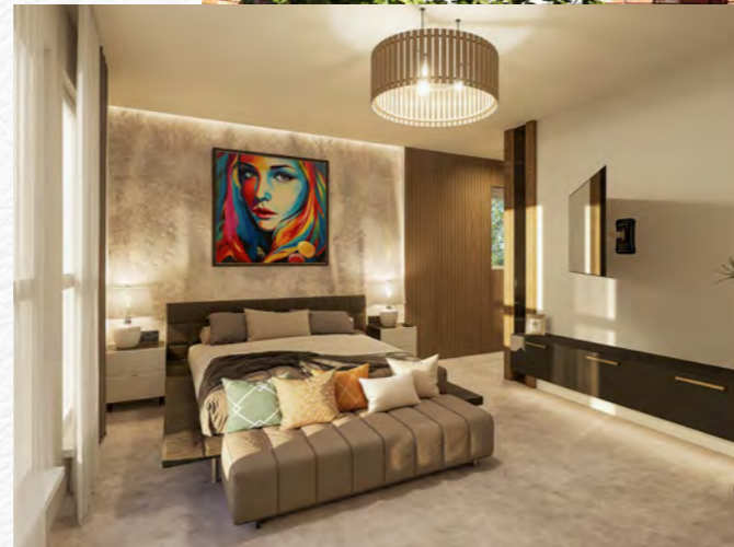
Computer generated images are indicative only and intended for illustrative purposes. Final specification and finishes may vary.

Each home provides over 2,500 sq ft of thoughtfully designed living space, featuring expansive kitchen and dining areas, elegant reception rooms, dedicated studies and four generously sized bedrooms.