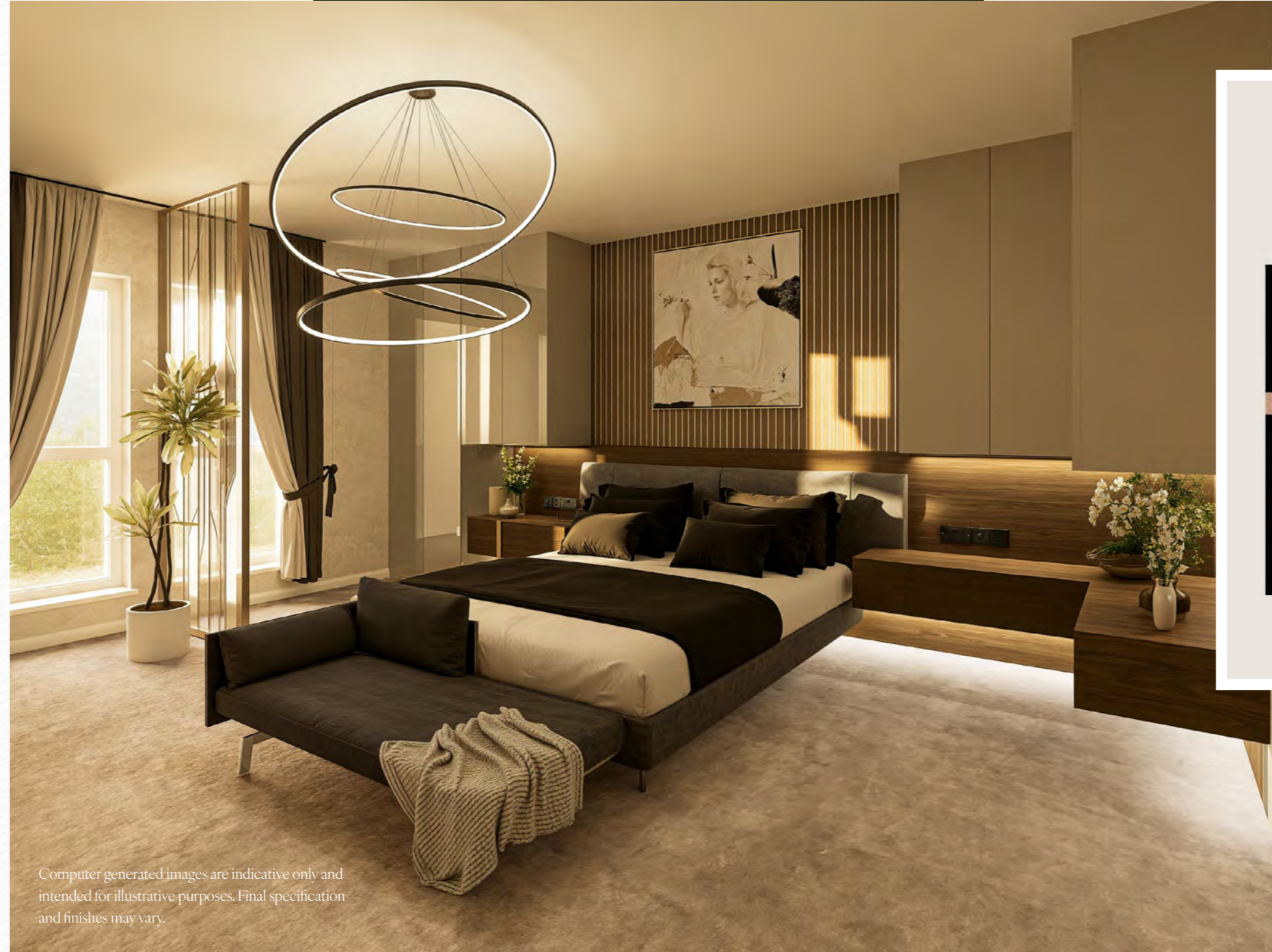
Computer generated images are indicative only and intended for illustrative purposes. Final specification and finishes may vary.

Upstairs, the home continues to impress with four spacious bedrooms. The principal suite benefits from a private dressing room and en-suite, while a second bedroom also enjoys its own en-suite. The remaining bedrooms are served by a well-appointed family bathroom. Set within generous landscaped plots and finished to a high specification throughout, The Buttercup offers a refined balance of style, comfort and practicality for modern family living.