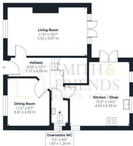
Ground Floor Building 1