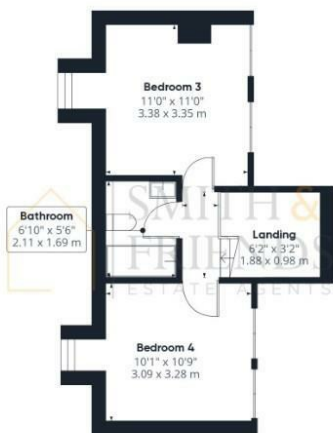
Floor 2 Building 1