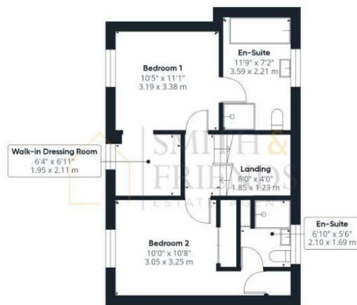
Floor 1 Building 1