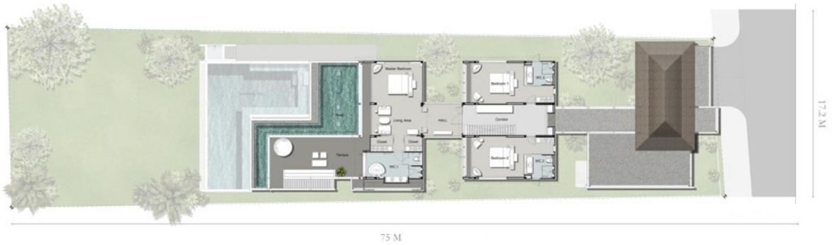
1st floor Approx. Area 1,053 Sq.m.