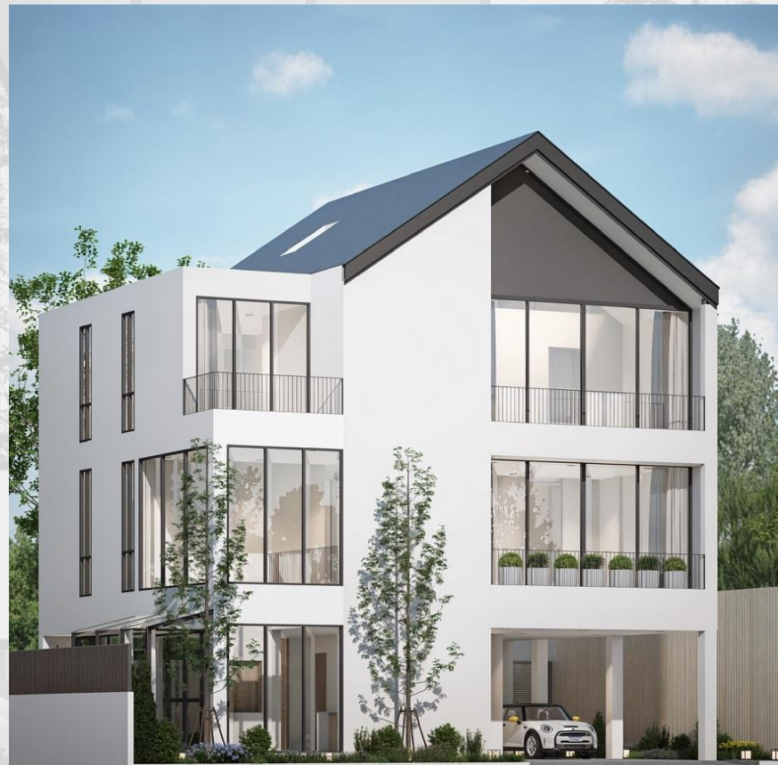
CLEAN, COZY, WARM, INVITING, AND SURROUNDED BY NATURE