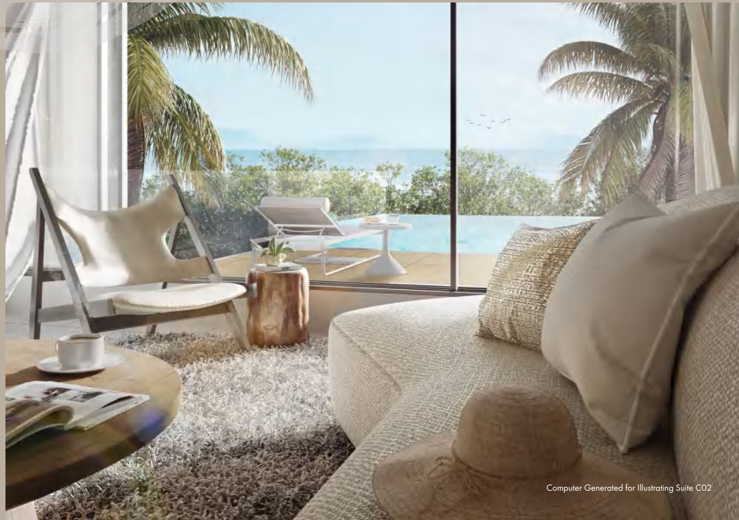
Computer Generated for Illustrating Suite C02

Delight in the seamless harmony of indoor and outdoor living, as large glass doors perfectly highlight glorious tropical vistas, creating luxuriously uplifting and airy living spaces that make you feel instantly refreshed and renewed.