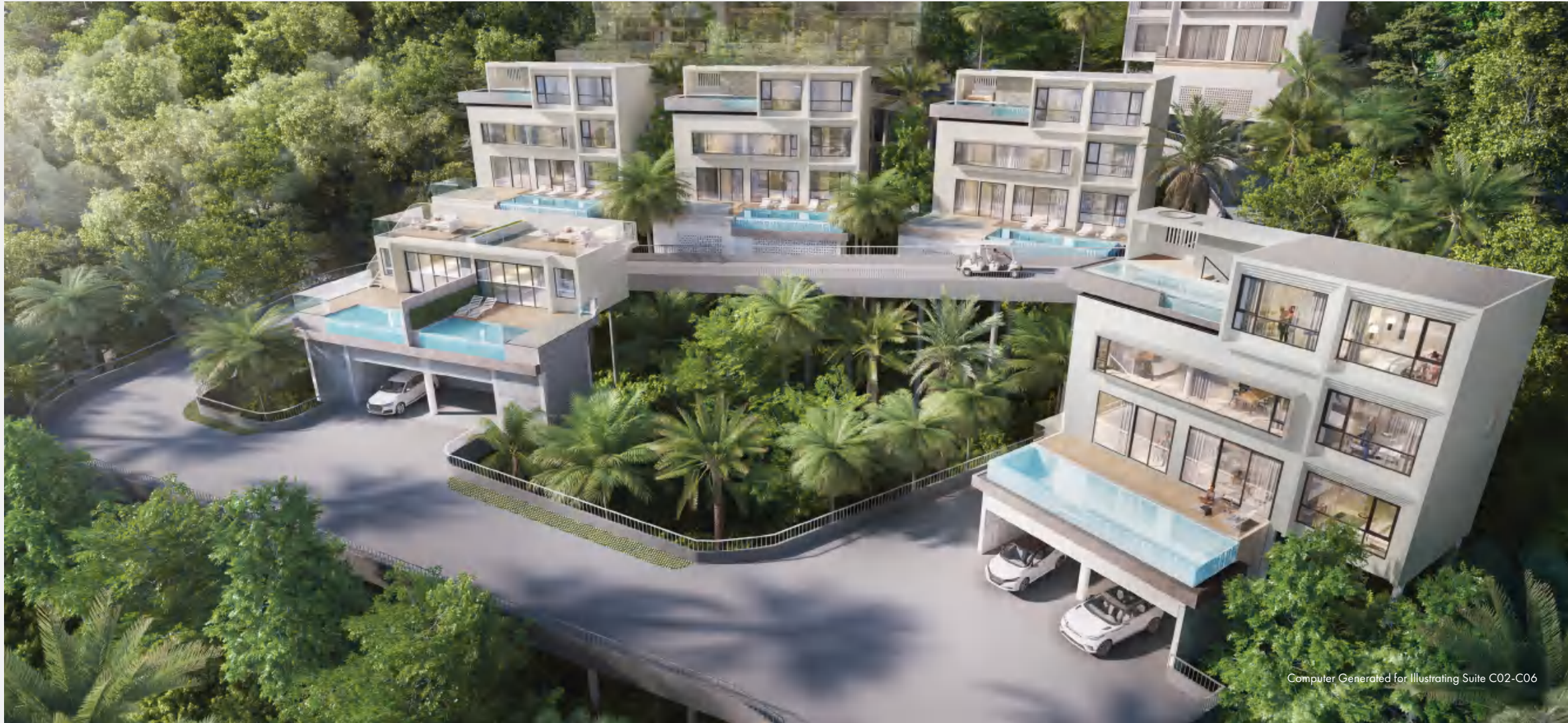
Computer Generated for Illustrating Suite C02-C06