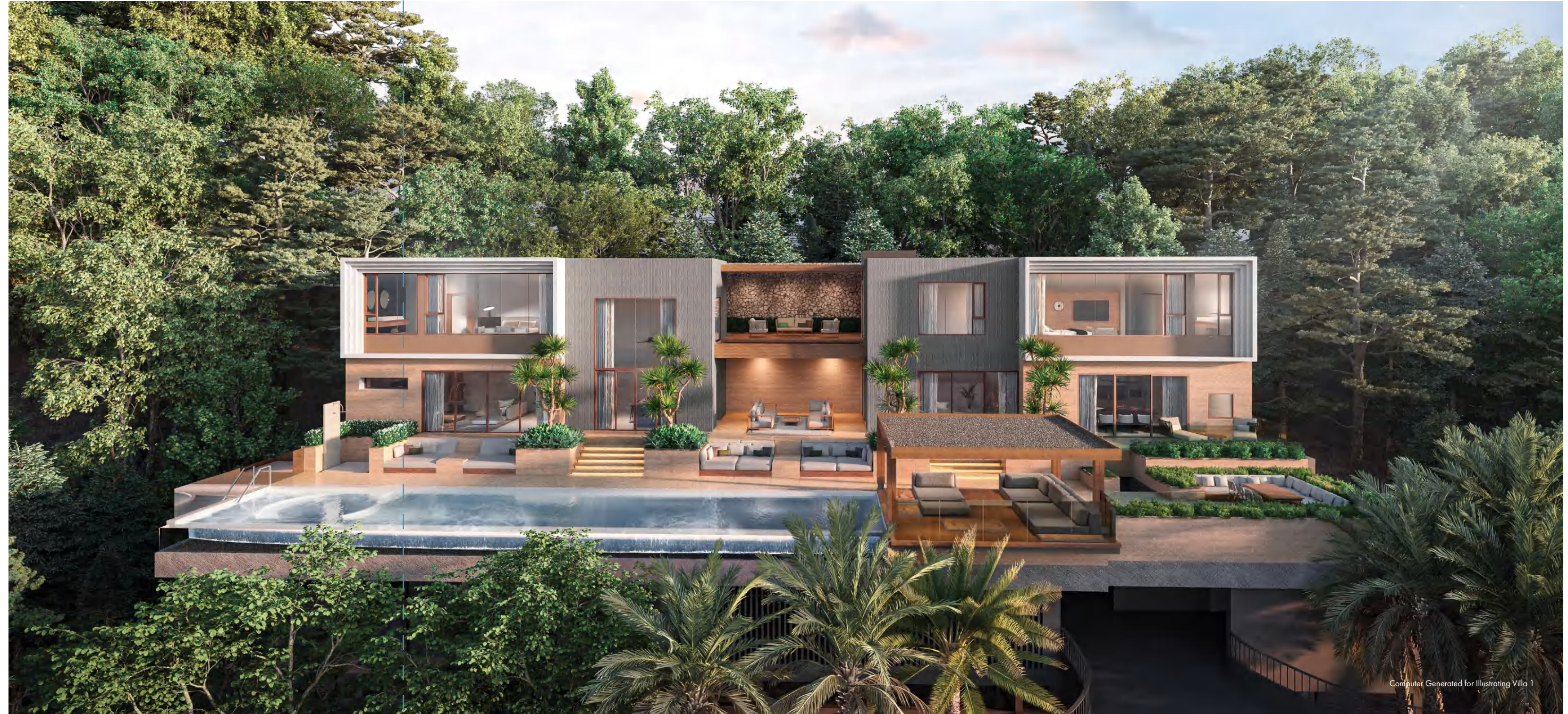
Computer Generated for Illustrating Villa 1