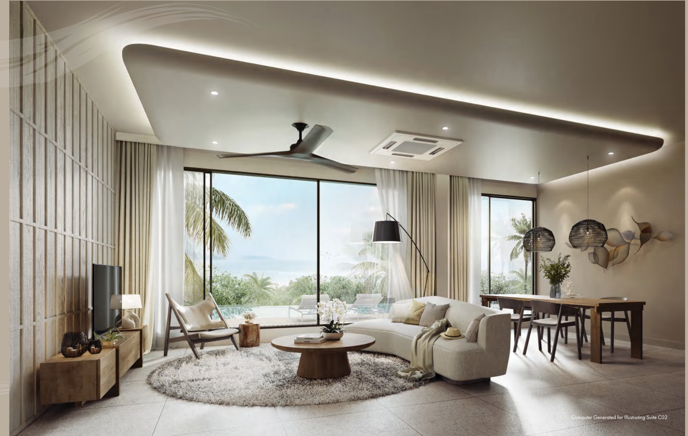
Computer Generated for Illustrating Suite C02

Ideal for a moment of peace and privacy, a cosy seating area within the bedroom suite becomes your favourite spot for enjoying a lazy morning coffee or a good book before bedtime.