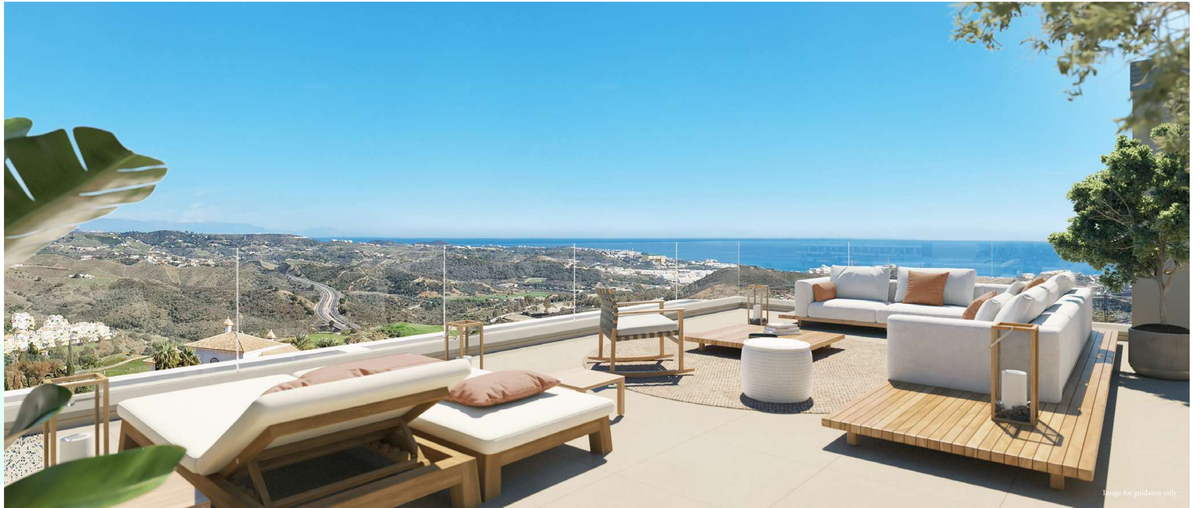
Image for guidance only